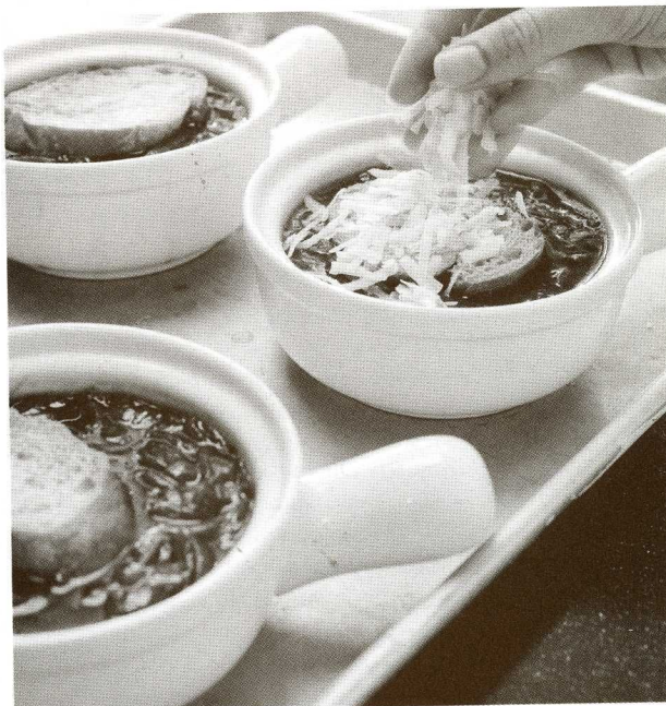
This soup is best finished under the broiler in oven-safe crocks. If using regular bowls, broil the cheese toasts separately.

Having watched Henri make his soup, I couldn't wait to give the recipe a try. But before I started cooking, I pondered his technique. When onions caramelize, a complex series of chemical reactions takes place. Heat causes water molecules to separate from the onions' sugar molecules. As they cook, the dehydrated sugar molecules react with each other to form new molecules that produce new colors, flavors, and aromas. (This is the same series of reactions that