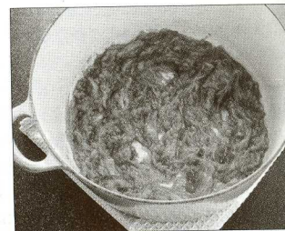
3. AFTER 2½ HOURS IN OVEN The onions are golden, wilted, and significantly reduced in volume.