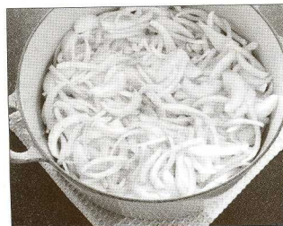
1. RAW The raw onions nearly fill a large Dutch oven.

Forget constant stirring on the stovetop. Cooking onions in the oven takes time but requires little attention.